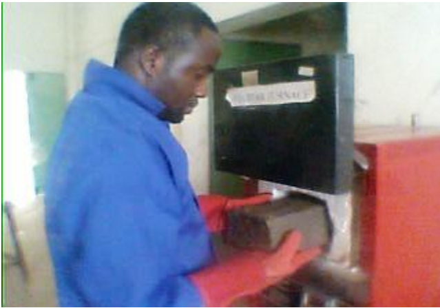
Fig. 1: Beam sample removed from the furnace after cooling

The variation of average ultimate tensile strength with the cover to reinforcement, at various temperature, is presented in Fig. 3. It shows that for each of the temperatures to which the reinforced concrete was heated, the average tensile test increased with increasing cover to reinforcement.